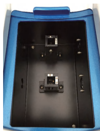
DU-8800D DU-8800DS Sample Holder