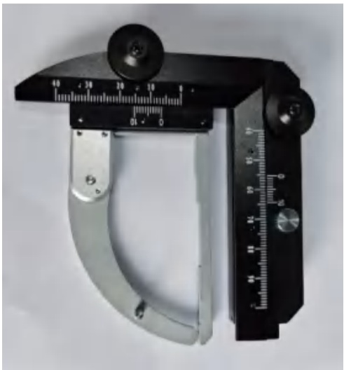
● POL-YDC Attached polarizing mechanical stage