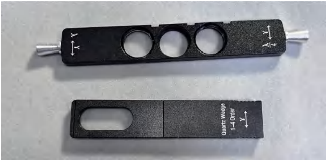
● Compensator: Quartz wedge, \lambda slip, \lambda/4 slip