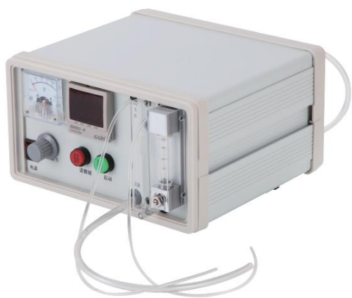
AAH-1 flow injection hydride generator