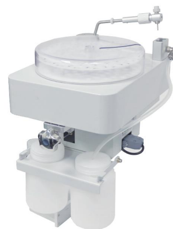
AS4030 Graphite furnace automatic sampler