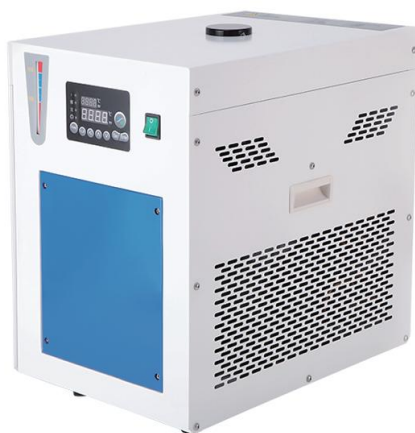
AS800A Cooling water circulator