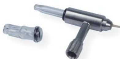
High efficiency glass atomizer