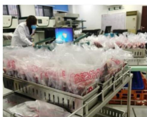
Blood Bank Center