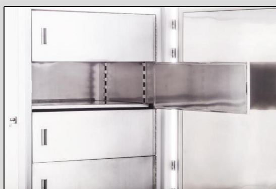
Stainless steel interior