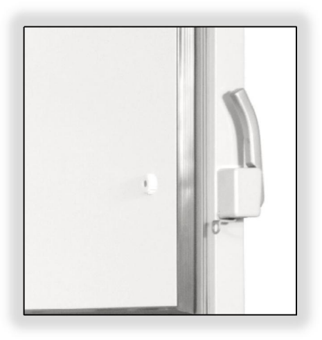
Pressure balance hole