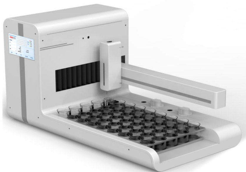
Working station pan view-Aluminum alloy

Application: Textiles, Leather samples/extraction solution