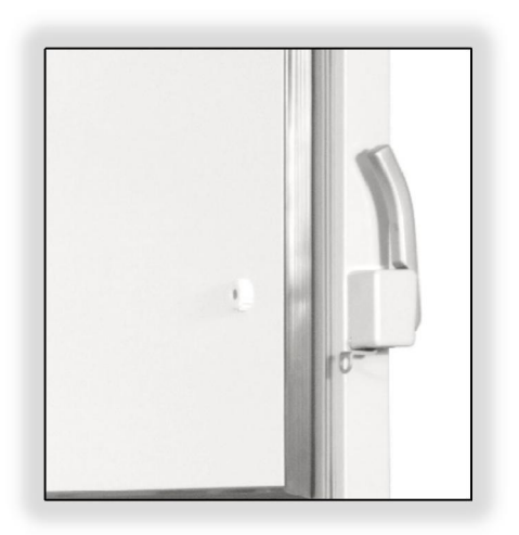
Pressure balance hole