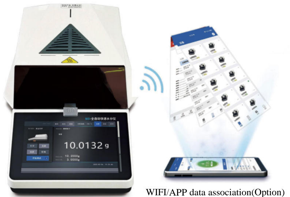
WIFI/APP data association(Optional)