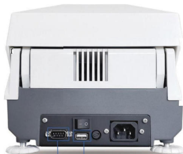
USB serial port (optional)